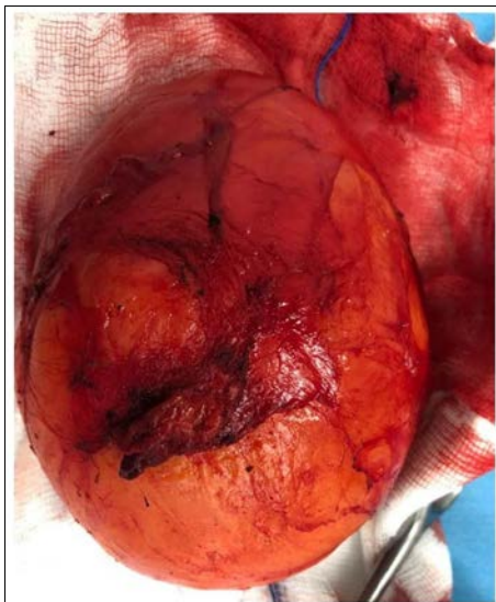
Fig 2: Identification of Neck Lipoma

During the ultrasound examination of the neck, a subcutaneous lipoma was identified, which was an unexpected finding. Further concerns were raised when the presence of internal foci of calcification within the lipoma was observed, which is considered atypical for lipomas. (Figure 2).